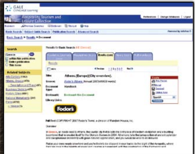
↑ Easy-to-understand information is returned quickly.