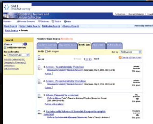
↑ Results from your search can yield content from magazines, academic journals, books, news and multimedia.